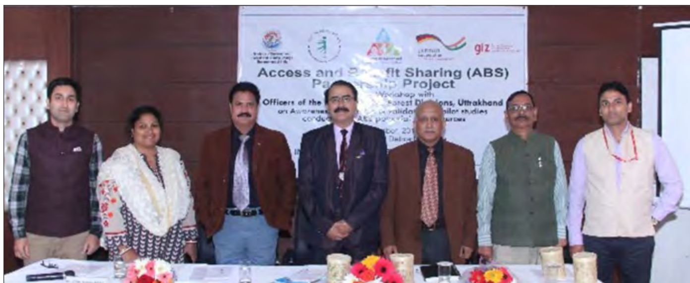
Workshop held in Dehradun on 14 th November 2017 – Uttarakhand Biodiversity Board officials along with personnel from ABS Partnership Project.

The project is also supporting Uttarakhand Biodiversity Board to engage with users of bio-resources for ABS compliance. A workshop was organised on 17 th November 2017 in Dehradun aiming at creating awareness on ABS among businesses. Representatives of PHD Chamber of Commerce, trade union groups and industries participated in the workshop.