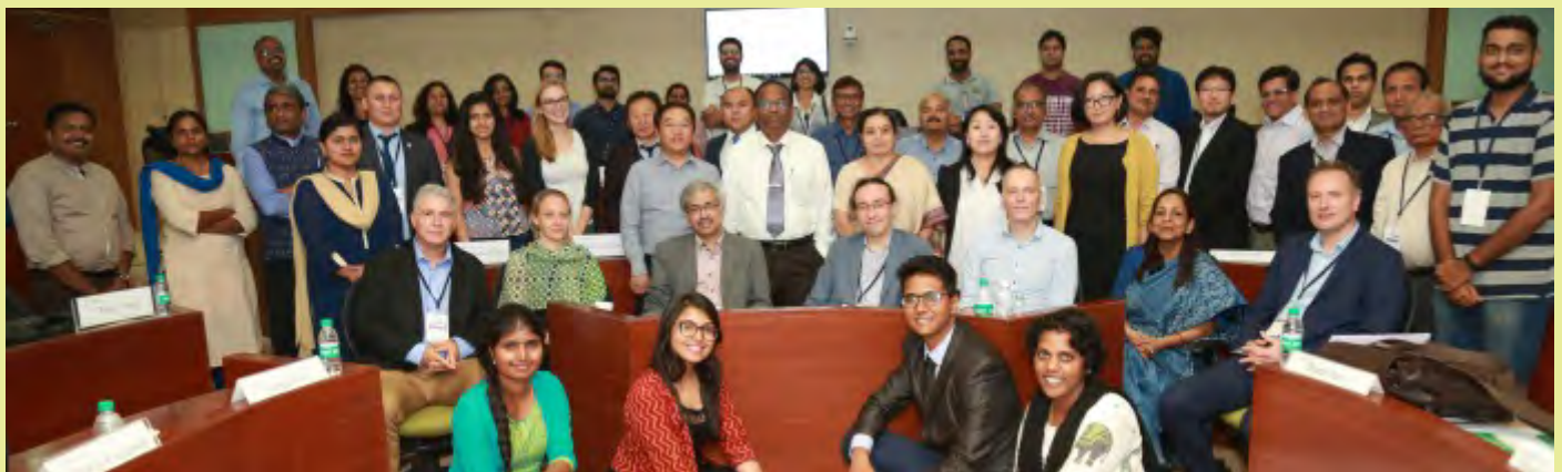
International BIOFIN workshop held at IIM-Bangalore on 17-18 November, 2017