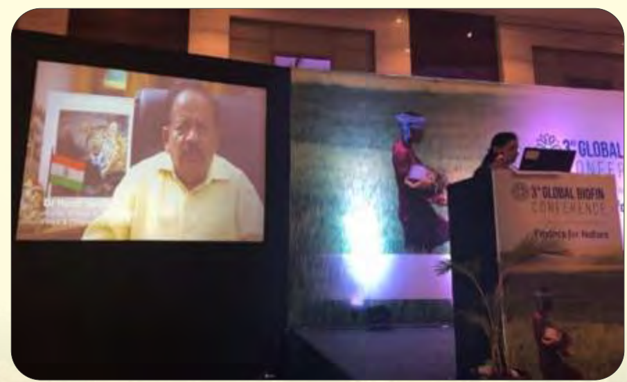
Address by Dr. Harsh Vardhan, Union Minister for Environment, Forest and Climate Change, Government of India at 3<sup>rd</sup> Global BIOFIN Conference.