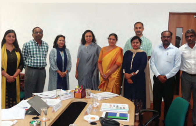
Participants of the BIOFIN Scoping Meeting towards preparation of a Biodiversity Finance Plan and a Resource Mobilization Strategy for the effective implementation of India's National Biodiversity Action Plan and its 12 NBTs held on 24, August, 2017 at NBA, Chennai

BIOFIN activities in India have picked up momentum in the third quarter of 2017 and several BIOFIN steps such as Nationally Driven Appraisal of Programme and Institutional Review (PIR) and Biodiversity Expenditure Review (BER) have been completed by the technical agencies and steps were taken to share, validate and finalize the results obtained in the process through stakeholder consultations. State level assessment of public expenditure for biodiversity in two pilot states of Maharashtra and Uttarakhand were also completed and currently efforts are being made to validate those results through stakeholder consultations.